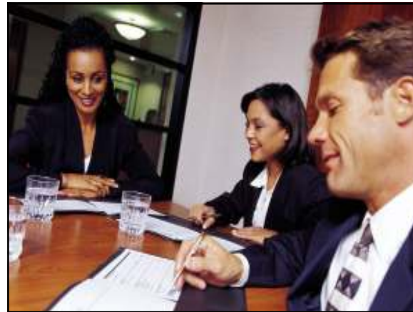
Each document to be recorded in the foreclosure process is checked by two different officers for accuracy.

We know buyers of Trust Deeds and can refer you to them if you are interested in selling your Deed. Sometimes it might be best to cash out now.